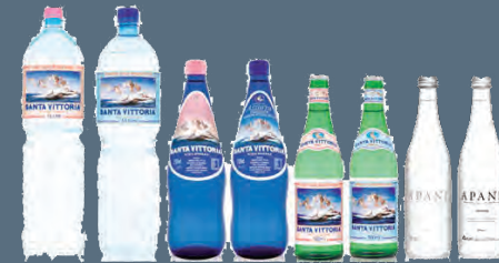
Water and mineral water