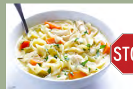
Soups w/ vegetables, noodles, rice, meat or other chunks of food