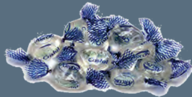
Clear Hard Candy