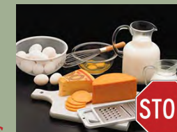
Milk and dairy products