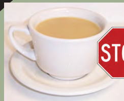
Coffee with Cream