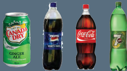
Soda, Coke, Pepsi, Ginger Ale