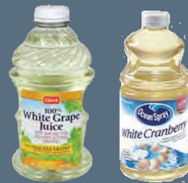
White Cranberry & White Grape Juice