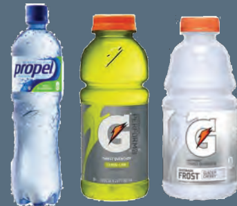
Clear sports drinks