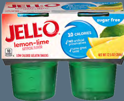
Lemon or Lime Jello