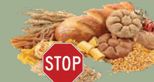
Breads, grains, rice, cereals